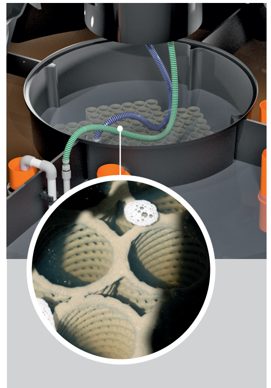
Biofilm overgrown fixed-bed